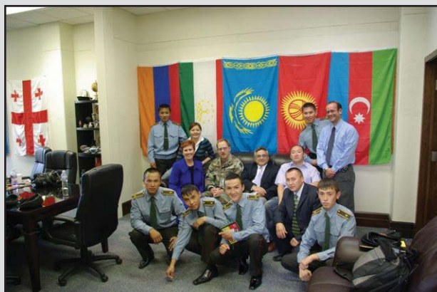
Members of the Montana National Guard and the Central and Southwest Asia Program with the visiting Kyrgyz Cadets.