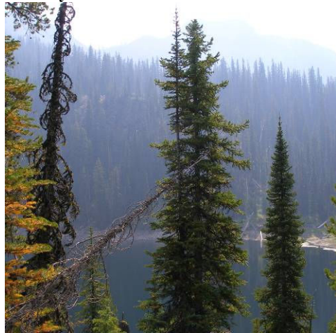
An old cabin between Carter and McKinley Lakes (left); Carter Lake (right).