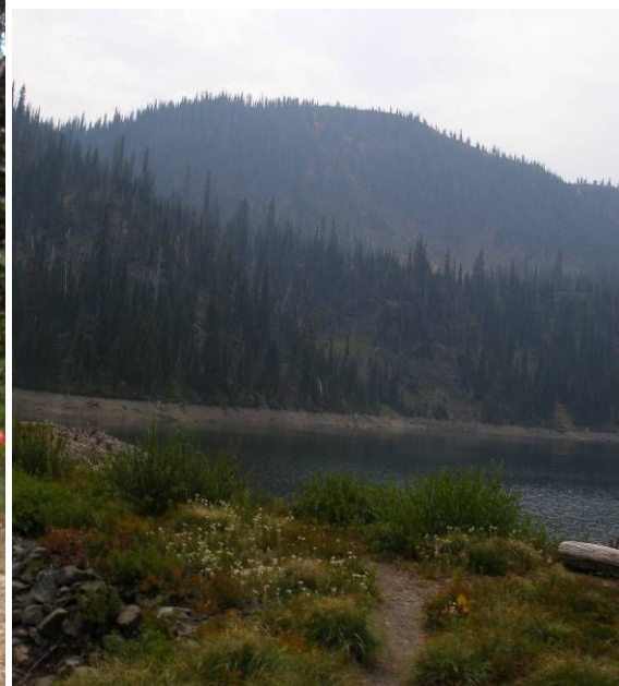
Left: late summer color; right: McKinley Lake.