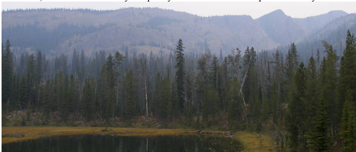
Mosquito Peak is in the upper-right of the picture.

There are a few directions that you can go once you reach the boundary. One is Lake Creek trail, which leads all the way to the Stuart Peak Trail along the ridge connecting Stuart and Mosquito Peaks. The trail skirts first Carter Lake and then McKinley Lake, which is where I turned around. After the long bike ride, the hike in was strenuous, but the trail was truly steep only in the last half mile up to McKinley Lake.