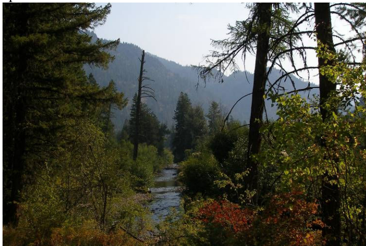
Along the lower section of Rattlesnake Creek upstream from the trailhead.

One of the hidden blessings of living in Missoula is our backyard wilderness area, the Rattlesnake. Excepting Stuart Peak, it is little visited. This is due, primarily, to its inaccessibility; it's a long slog into the most remote and beautiful lakes from all of the trailheads, and in particular from the Rattlesnake Trailhead in north Missoula.