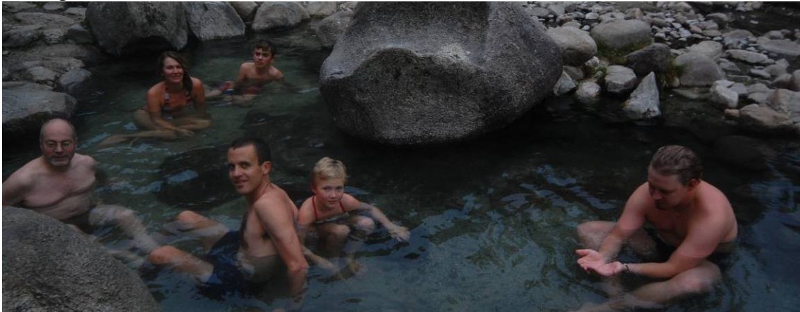
The upper pool.

There are two main spots for soaking. Both are about 1 mile from the parking area and the walk through the cedars and the pools themselves are beautiful. The first pool is right next to the creek and is a more pristine spot than the upper pools. The upper pool is the largest and the most visited. To be frank, they are overused, but it's still one of the nicest places around.