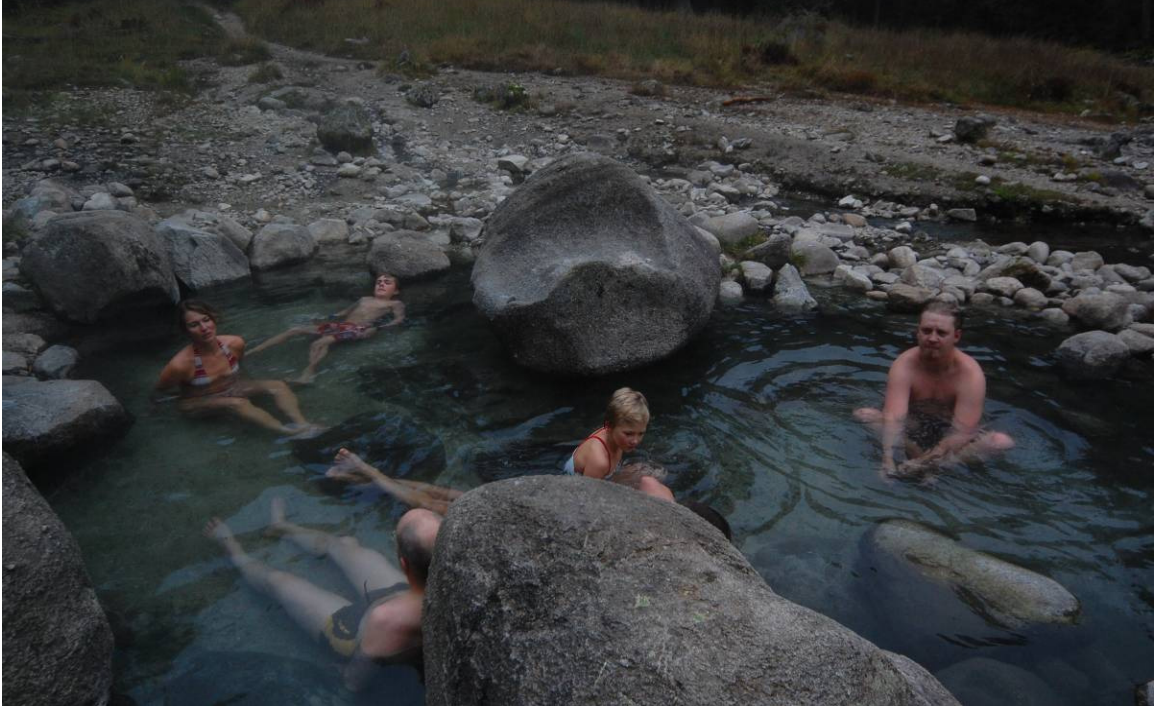
The upper pool again